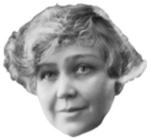
Helen Mayo Pioneer of women's and children's health and University of Adelaide graduate