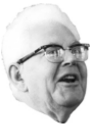
Sir Mark Oliphant Graduate of the University of Adelaide, eminent scientist and Governor of South Australia