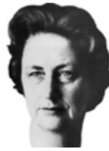
Dame Roma Mitchell Graduate of the University of Adelaide, outstanding scholar, foremost female legal pioneer, first woman judge, first woman State Governor and first woman Chancellor of an Australian University