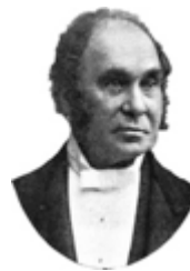
Sir Thomas Elder Pastoralist, entrepreneur and founding and generous benefactor to the University of Adelaide