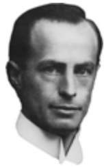
Sir Douglas Mawson Professor of Geology at the University of Adelaide and Antarctic explorer extraordinaire