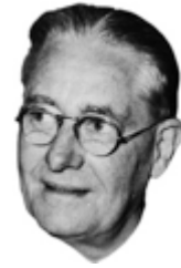
Lord Howard Florey Graduate of the University of Adelaide and Nobel Laureate for his work on penicillin